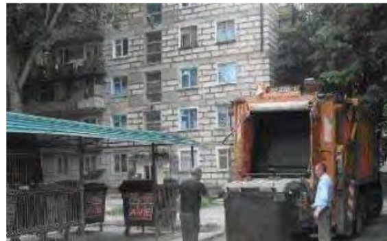
Waste selected in fractions