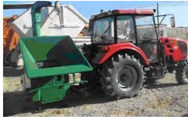
Waste collection process